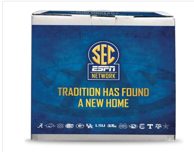
FRONT LABEL - FRONT VIEW

Front label portion - 17L x 14H / Side label portion - 12L x 14H