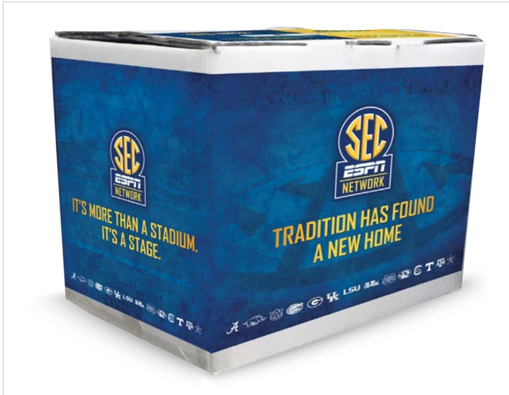
FRONT / SIDE LABEL - ANGLE VIEW

Front label portion - 17L x 14H / Side label portion - 12L x 14H