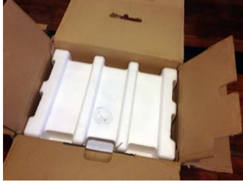
Top piece of Styrofoam inside product box