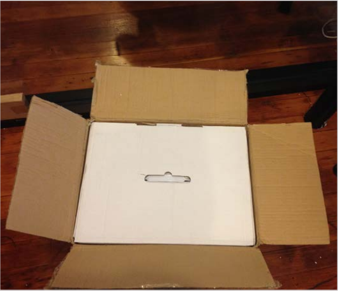
SHIPPING BOX 17.5L x 12.75W x 15.75H (kraft outer box) PRODUCT BOX 17W x 12.375L x 15H (white inner box)