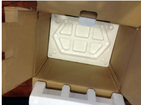
Bottom piece of Styrofoam inside product box