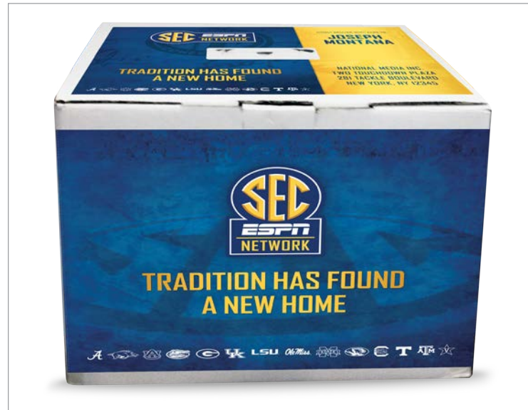
TOP LABEL - SINGLE LABEL OPTION