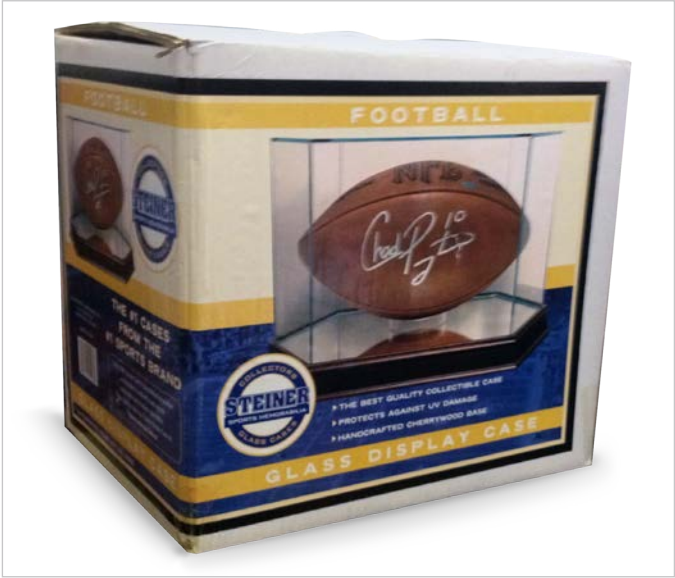
PRODUCT BOX 17W x 12.375L x 15H Shown removed from shipping box. Product box is heavy duty white cardboard with a handle on the top and a product label that wraps around the front and left sides of the box. Styrofoam inserts secure the display case inside the box.