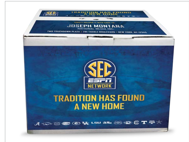
TOP LABELS - DOUBLE LABEL OPTION